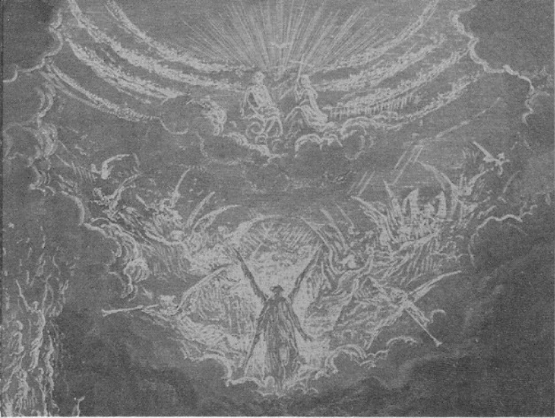
DRAWINGS BY PAUL GUSTAVE DORE

In Daniel 7 the rise of the Gentile empires that culminate in the rule of Antichrist are pictured rather dramatically. Daniel saw the four winds of heaven colliding and stirring up the sea until four great beasts—representing the Gentile kingdoms—rose out of the boiling waters. The picture is that of spiritual influences descending on the nations from every direction and churning them wildly until out of the storm come these world kingdoms. Today the churning of the sea of humanity has become violent indeed, and out of this will come the world empire to be ruled briefly by Satan's false messiah. During those days human defiance of God will reach its terrible climax.