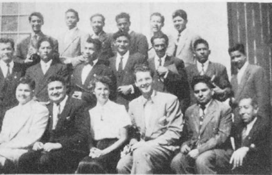
The second-year students and faculty, 1954.

REAL REVIVAL IS BURSTING OUT ALL over Guatemala. Sixty people were saved in the Tiquisate area during the month of October. Other churches report varying sums: fifty-one, thirty-five, fifteen, and so on. Another church has raised $1200 from among its own people to