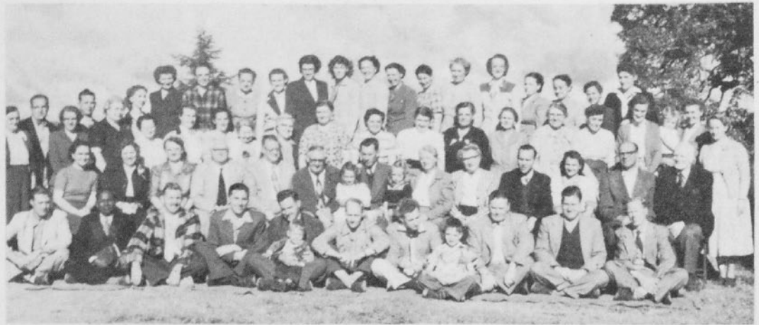
The North India Convention was held at Childer's Lodge, Landour, Mussoorie

Please pray also that the Lord will bless our radio broadcast in a special way so that many souls may be saved and a Pentecostal revival kindled wherever people hear our message. Ask the Lord to keep us physically fit, mentally alert, and spiritually "on fire" until we finish the work that He has given us to do in Tangier.