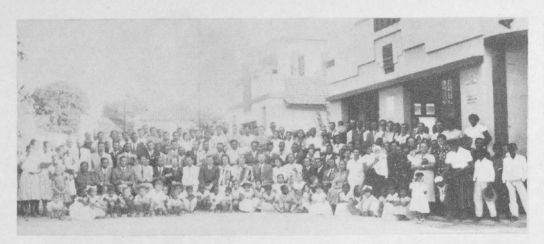
Students and teachers of the annual short-term Bible school at Lavras, Brazil