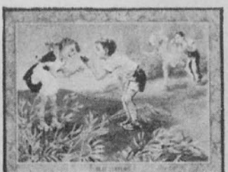
8 EV 5453 Butterflies