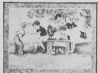
8 EV 5451 Baby Chickens