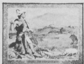
8 EV 5457 David the Shepherd Boy