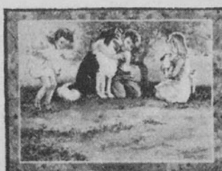
8 EV 5456 Collie Dogs