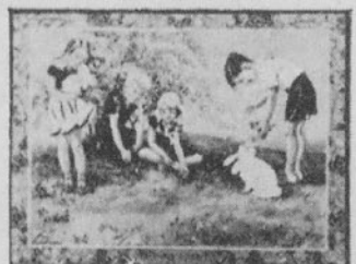
8 EV 5452 Bunny Rabbits