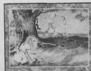
8 EV 5467 Squirrels