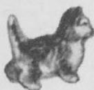
8 EV 5483