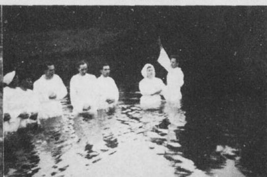
BAPTISMAL SERVICE OF UKRAINIAN BRANCH IN LIEGE, BELGIUM

The Ukrainian Branch of the Assembly in Liege, Belgium, holding a baptismal service at the outskirts of Liege.