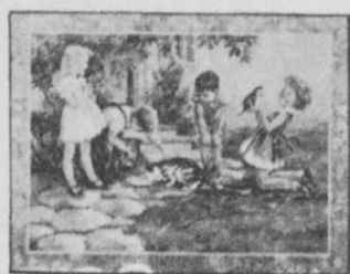
8 EV 5464 Kittens