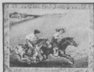
8 EV 5466 Shetland Ponies