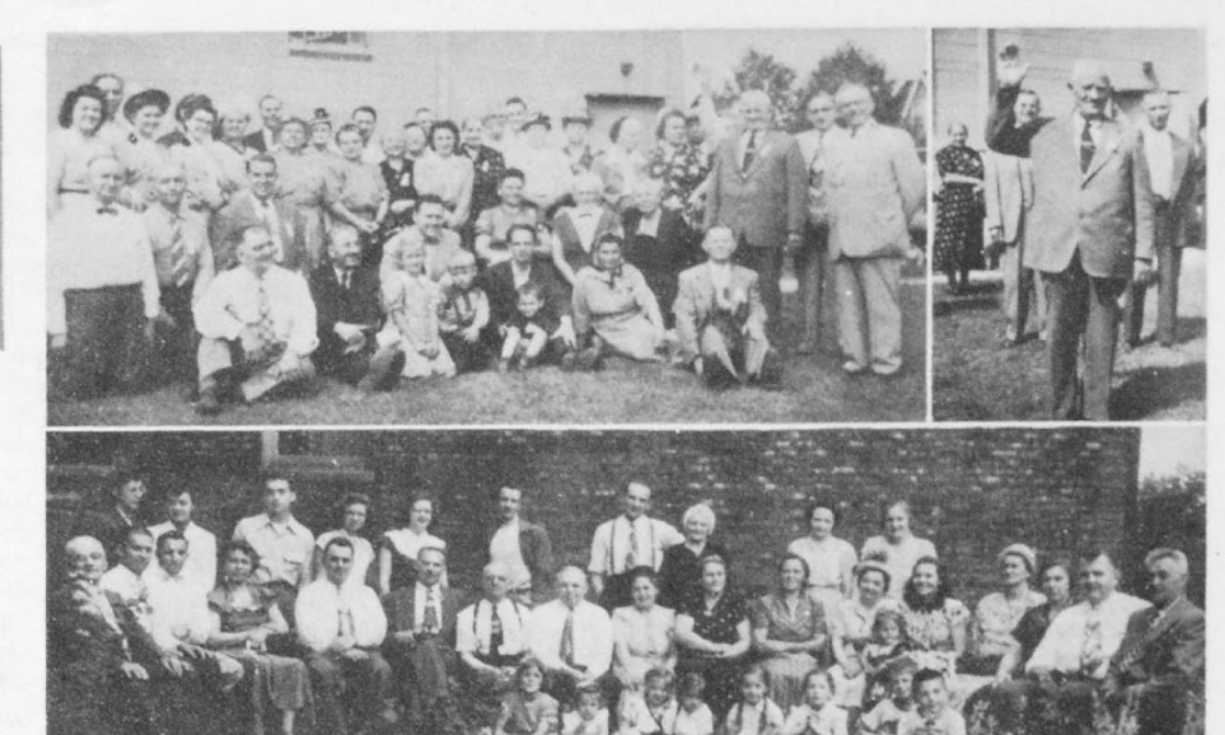
1. Group at Yugoslavian Convention, Detroit. 2. This man testifies to a marvelous healing at the Yugoslavian Convention. 3. Third annual Czechoslovak Assemblies of God Conference, Chicago.

Old Testament Life of Christ Book of Revelation Pauline Epistles For information write to CORRESPONDENCE SCHOOL 434 W. Pacific St., Springfield 1, Mo.