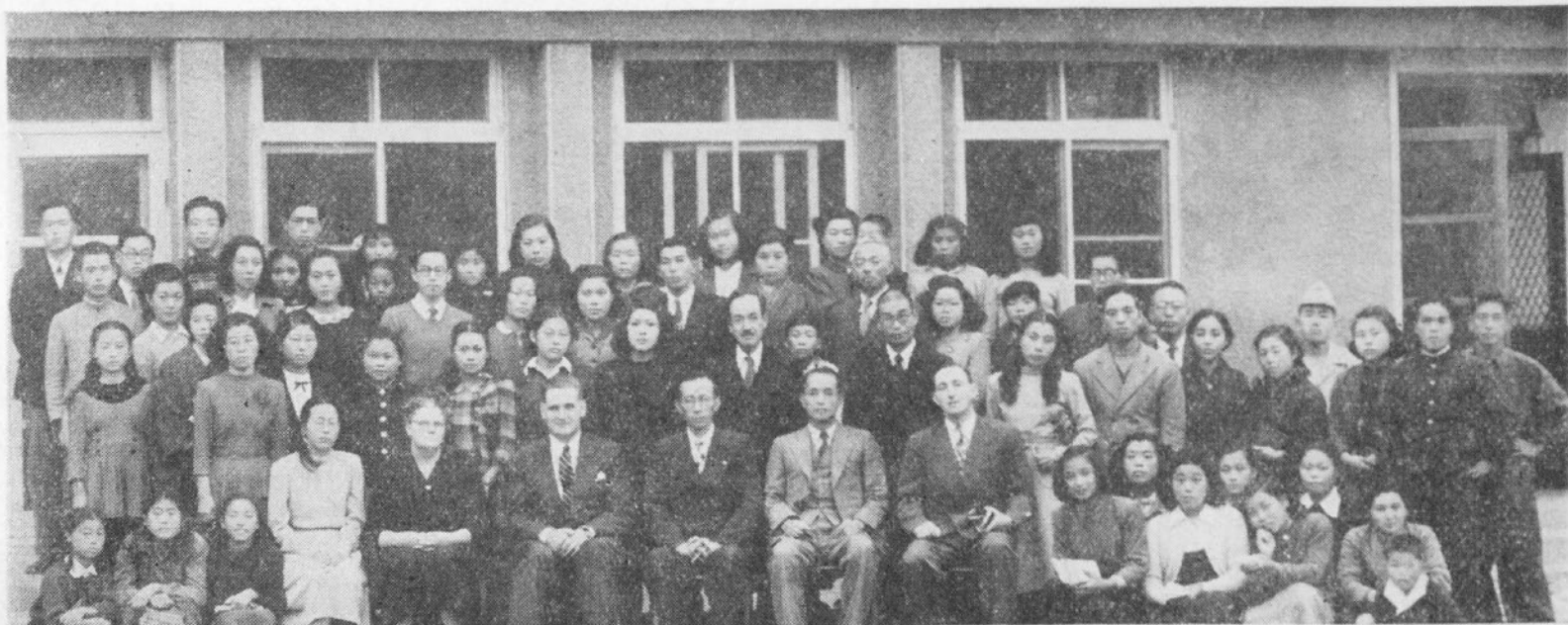
NEW CHURCH IN SENDAI CITY, JAPAN