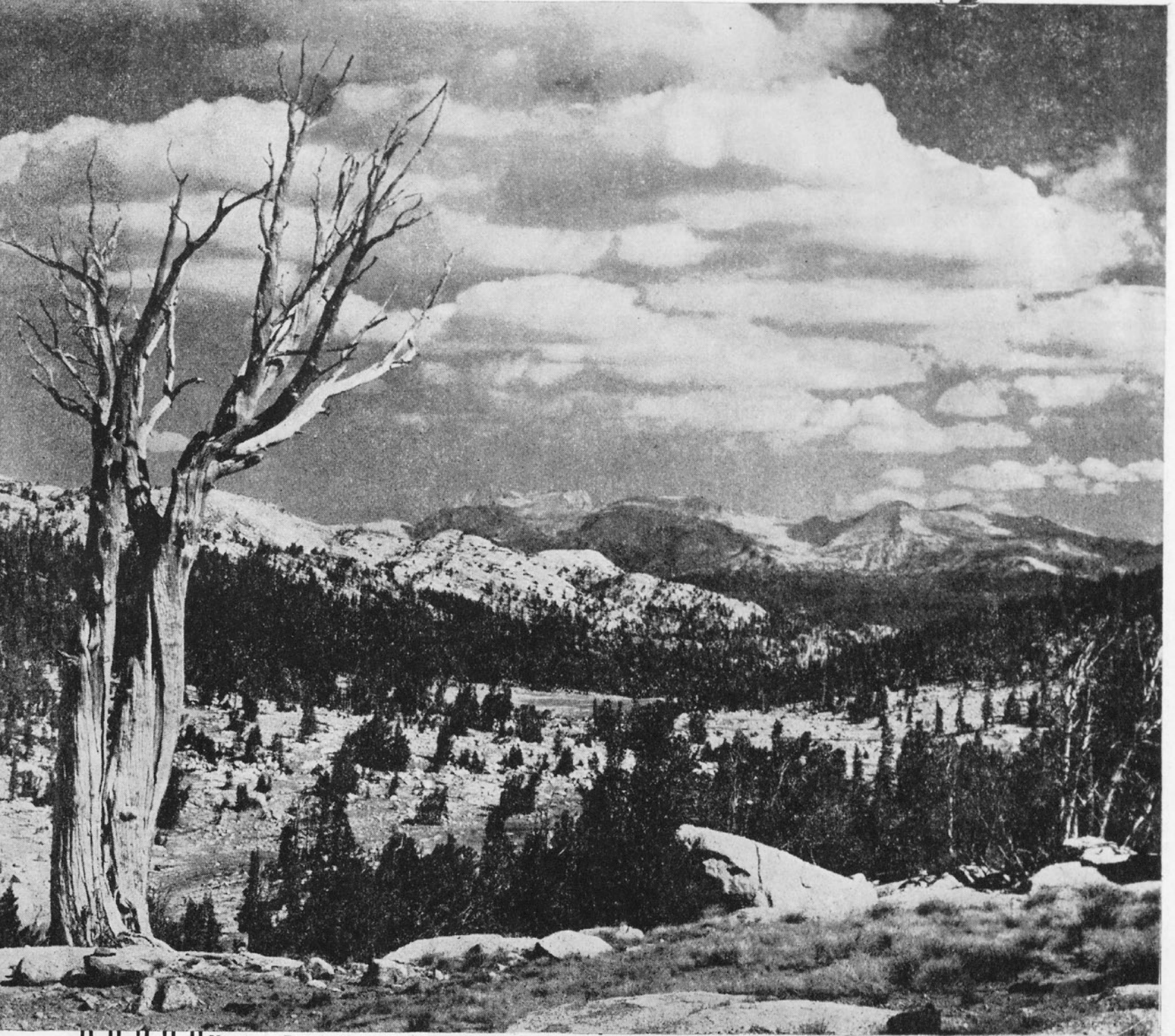
Vogelsang Pass in Yosemite National Park, California