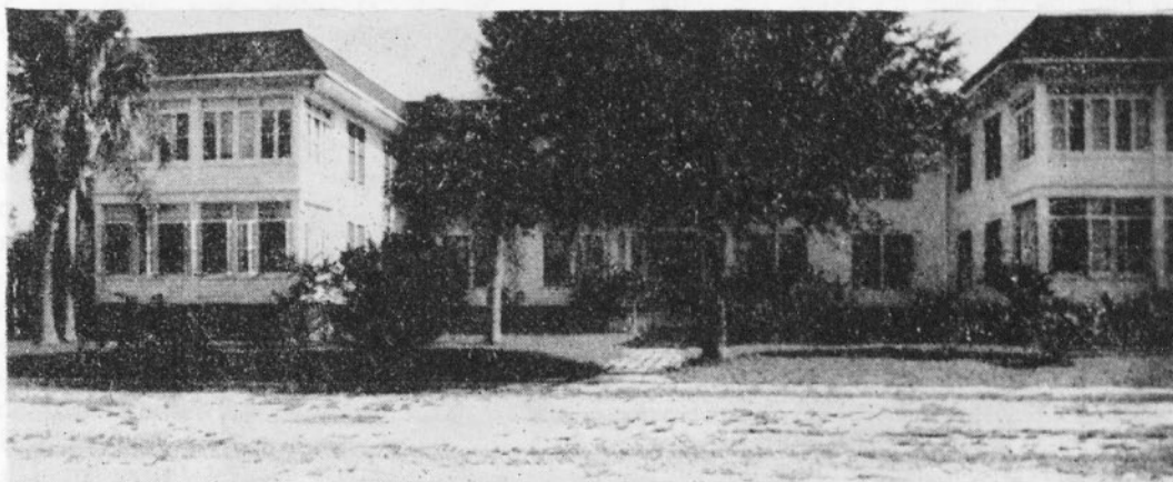
Our Retirement Home for Ministers and Missionaries, Pinellas Park, Florida.

The preacher made an altar call. "Who wants to give himself to Christ?" he asked. I put my hand up. He looked down at me, with my long hair, my fine clothes, diamond pin, gold watch, and all, and wondered if I was not a spy. Others raised their hands too. Then the preacher asked if anybody wanted prayer for healing, so I put my hand up again. He said, "Everyone who wants prayer, kindly rise and come to the altar." So I walked to the front, and started to introduce myself to the preacher, but he said roughly, "Kneel down there." I am glad I had learned obedience, otherwise I might have lost the blessing. I knelt, and the moment my knees touched the floor the Spirit of God came upon me in power and glory. For half an hour I was shaking under the power of God. With all my sedateness, and all my knowledge of how to behave in church (and we Catholics had been