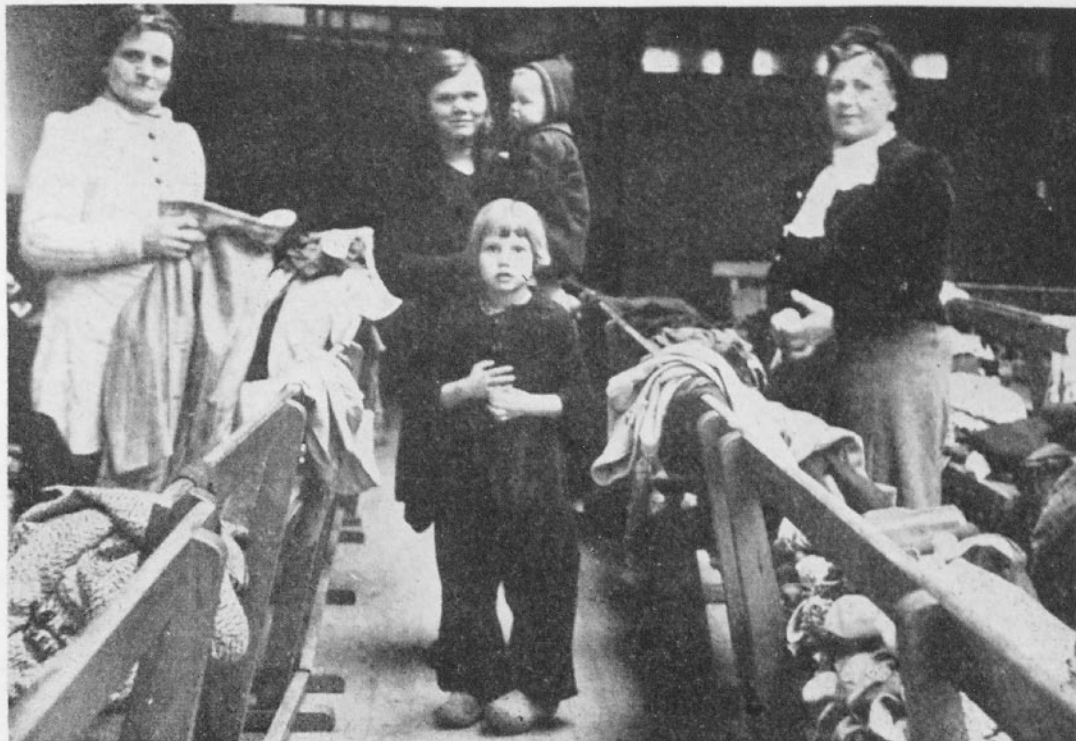
● An Assemblies of God relief clothing depot in Holland, distributing the clothing sent from America.

for the clothing and footwear, which you in obedience to the leading of God have sent to Holland.