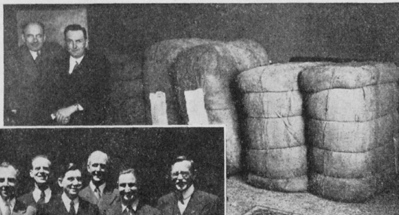
● Right—Some of the 44 bales of clothing sent to Belgium in April.

We found the same hunger in Doxato and Drama. All of these places are in territory where the gospel was first preached by Paul.