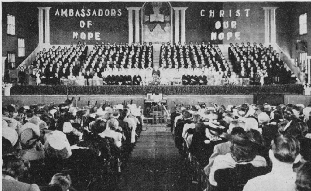
At the Baccalaureate Service, Central Bible Institute

We are living in critical days, days of pressure, and days of stress and strain. If we ever needed God, if we ever needed the motto that the senior class has, "Ambassadors of Hope," surely it is right now. I trust that as you go out from this school it will be with the knowledge and with the memory that here you learned to know God better; that here you have learned to love the Lord, so that when you meet success or adversity, darkness or light, you will find yourselves rooted and grounded in God, and able to stand for principle, (Continued on Four)