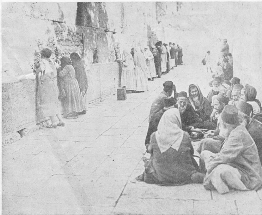
THE ANCIENT WAILING WALL

Near the foot of the old Temple wall in Jerusalem, devout Jews gather on Friday afternoons and on Saturdays, to bewail the fate that has come to Israel. As can be seen in this picture, groups of elderly men sit in circles, to read from their sacred scrolls and to discuss the glories of ancient Israel. They express their lamentations in a chant: