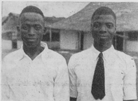
Young men of Liberia—typical of the fine young Christians in training at the Bible school.

I finish a letter, tie up our home-going mail which I place in a tin and that in a waterproof bag ready for porters to take on the week's trek to Cape Palmas, and come back with supplies and mail (we hope!).