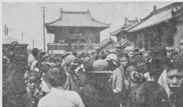
Grandam Temple at Newchwang, Manchuria. This is only a glimpse of the crowds that entered the gate (shown at the right) to worship the idols.

Please pray for Shiku. Opposition has been increasing this last month and we have been more conscious of the powers of darkness than ever before. Last week