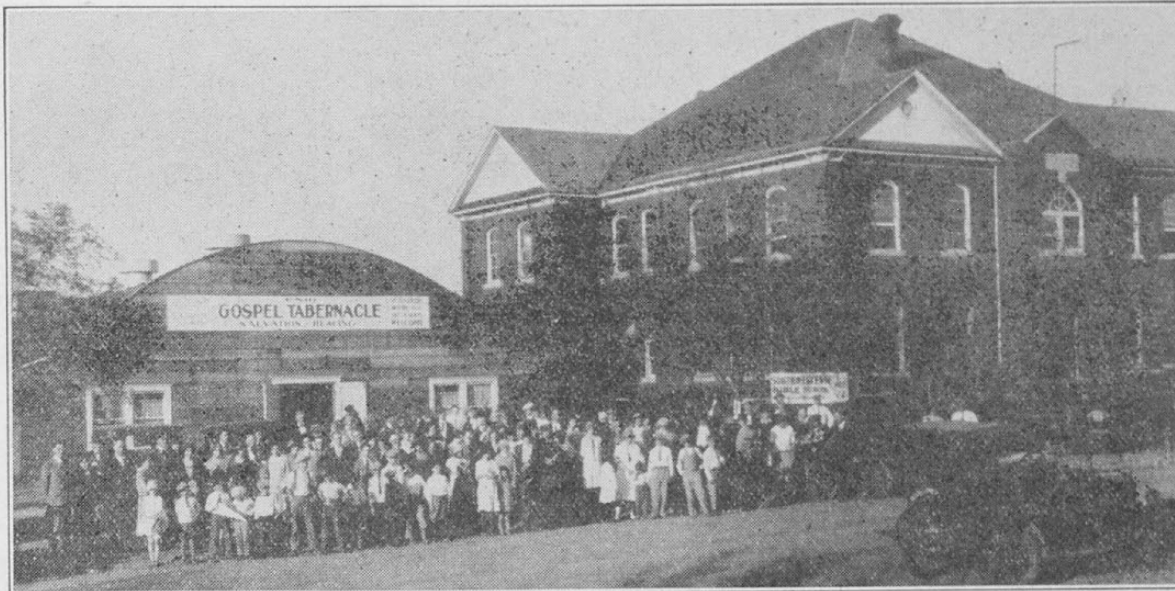
Southwestern Bible School, Enid, Okla.