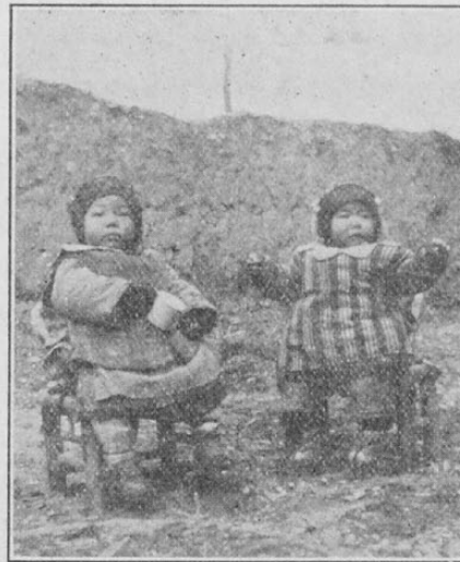
Two of Our Juniors

"The soldiers were a wild, dirty, half-clad, ill-fed, crowd with many ex-bandits among them and they were not any too particular concerning the rights of others.