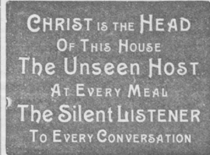
Red and Green Texts No. 5401—See illustration for text. No. 5403—Same as No. 5401 except Guest is used instead of Host. This motto has a far-reaching influence. "Christ is the head of this house" is desired in every Christian home. Size, 13x10 inches. 40 cents