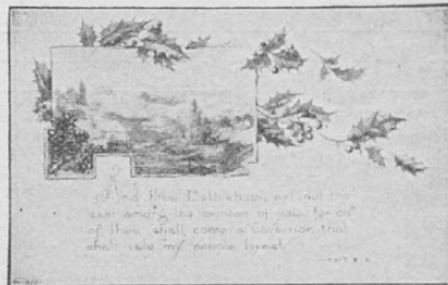
CHRISTMAS CARDS No. 6313. An entirely new departure in the greeting-card line. Designs show Scripture scenes. Bevelled gilt edges. Size 5½x4, with envelopes. 5c each, 50c doz.