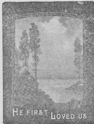
Red and Green Texts No. 5615—He first loved us. No. 5616—Hope thou in God. "On Moonlight Bay" is the name of the picture on this new series. The name of this picture, coupled with such wonderful texts, suggests the convincing beauty of these mottoes. Size, 10 by 13 inches. 50 cents