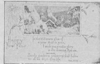
NEW YEAR'S SCRIPTURE TEXT POST-CARDS These post-cards are reproductions in eight colors of famous paintings. Each card has an attractively hand-lettered sentiment and Scripture text. Price 20c per doz. postpaid $1.25 per hundred postpaid

Gospel Publishing House Springfield, Mo.