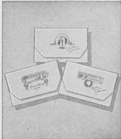
No. 500 Four scenes of the nativity with fitting Scripture texts and Christmas greeting. Printed on heavy stock. Bevelled gilt edge. Size 4x2½ inches with envelopes. Price 5c each postpaid 50c per dozen postpaid