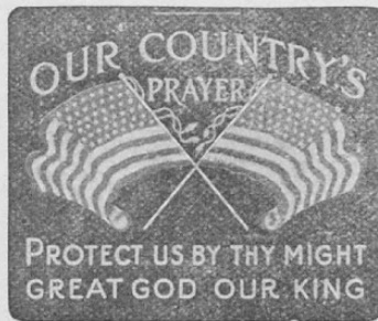
Navy Blue Only No. 5400—Protect us by thy might, great God, our King. This motto expresses that innermost desire of every intelligent American Christian. The artistic embossed design—bearing the flag of the Union is tinted in its three colors. Size, 10x12 inches 40 cents