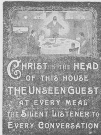
Red and Green No. 5601—Christ is the head of this house, the unseen guest at every meal, the silent listener to every conversation. Something entirely new and different in the "Christ is the Head" motto. The picture at the top in colors is very appropriate and is sure to help make this motto appreciated in any home. Specially desirable for the dining-room. Size, 10x13 inches 50 cents