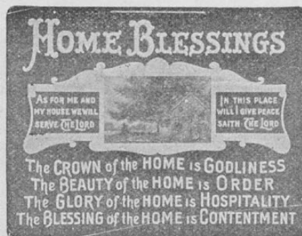
Red and Green No. 5501.—A very popular motto. The beautiful lines of sentiment beneath the design and picture make it a favorite. Size, 13x10 inches 45 cents