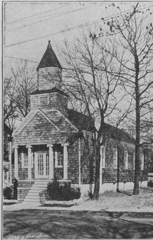
The New Pentecostal Church, Asbury Park, N. J.