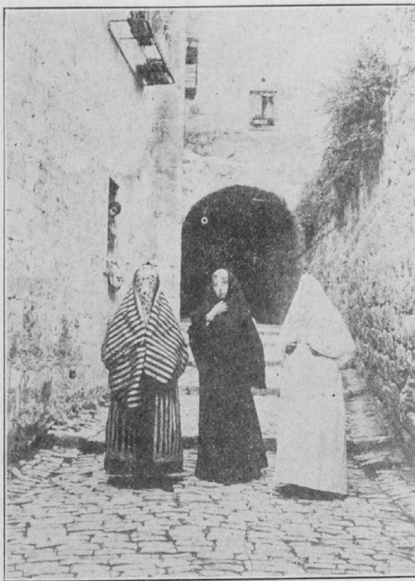
Mohammedan women in Jerusalem.

What about the present? In 1922 about 100,000 Jews settled in the Holy Land. The long night of years is past, a new day is dawning. One Jewish society planted 46,200 fruit trees in less than one year; and in the last four years 717,000 trees, and thousands of Eucalyptus