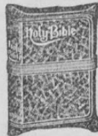
Size 5 1/2 x 3 1/2 inches.

The text is self-pronouncing, by whose aid children can learn to pronounce the difficult Scripture proper names.