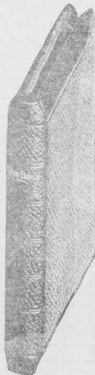
Showing Divinity Circuit Feature.

We have been enabled to secure a number of excellent Bibles printed at the Oxford University Press on the famous Oxford India paper at a price considerably below current prices, and as we have some very heavy paper bills to meet, we have decided to make a special cash price offer of these.