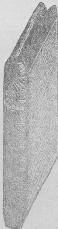
Showing Divinity Circuit Feature.

We have been enabled to secure a number of excellent Bibles printed at the Oxford University Press on the famous Oxford India paper at a price considerably below current prices, and as we have some very heavy paper bills to meet, we have decided to make a special cash price offer of these.