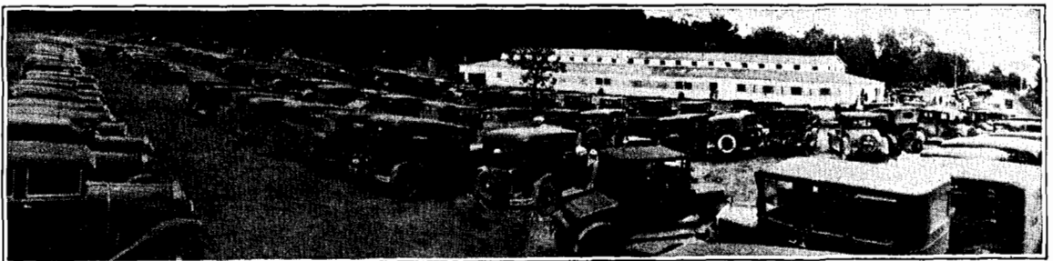
CARS PARKED AROUND THE TABERNACLE

A deep well provides cold pure drinking water through six bubblers which are located around the edge of the fish pond overlooking the lake.