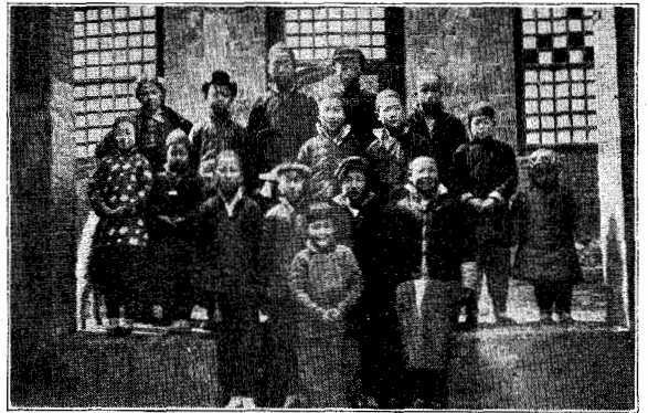
First Year's Converts in North China

One day he was tempted to want some of the money he had left when he ran away from his aunt. The money was his by law if he stayed there. He went back and asked his aunt to let him have two thousand dollars to start in business. Then he thought he could be independent and have better food and better clothing than I could give him. When he put the matter before his aunt, she called in his relatives, about twenty of them, to decide the matter. After two days' discussion they told him that if he would give up Jesus, he could not only have the $2,000, but the entire estate valued at from six to seven thousand dollars, quite a fortune for the Chinese.