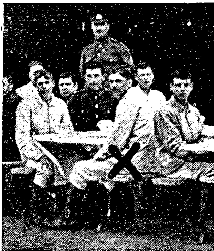
A SOLDIER WHO SAW THE MONS ANGELS. (See page 6.)

ALL SAINTS' VICARAGE, SUNDERLAND, ENGLAND.