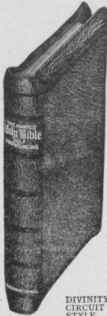
DIVINITY CIRCUIT STYLE

SPECIMEN OF TYPE. This specimen shows only the black printing—The Bible is printed in five colors