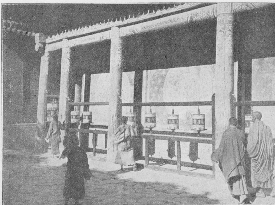
Pilgrims and priests turning prayer-wheels at Kum Bum, a famous Tibetan monastery.

There are more than 3,000 priests in Kum Bum.