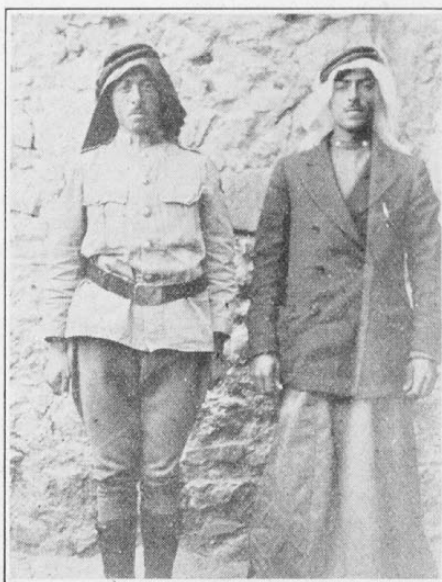
Workers in Transjordan These two men are faithful witnesses for Christ, one a soldier and the other a former policeman but now a merchant.

We thank God He permitted no evil to befall our mission during the past two weeks of trouble, and though most of the houses between our street corner and the Damascus Gate have had all their doors and windows broken, yet He did not permit one stone to be thrown towards our building, and in an extraordinary way all our family and the visitors in the mission home, who usually do not come back from their sight-seeing trips until about one o'clock, all seemed impelled on that dreadful Friday of the outbreak, to return home before twelve. In less than fifteen minutes after the last one had come in, our street and neighborhood