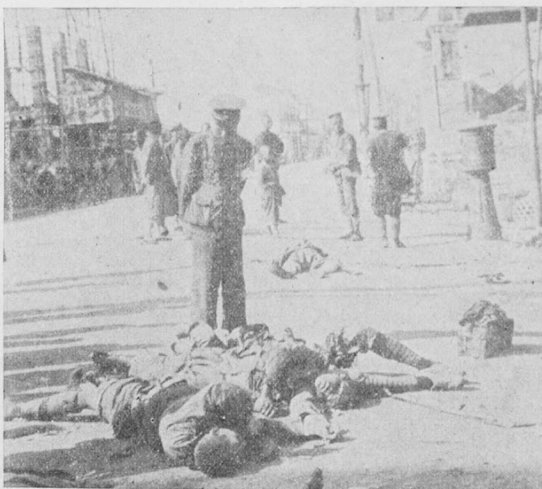
The Aftermath of the Canton Riot

I am sure you wonder what can be done for the Lord under these trying circumstances; yet despite the darkness, God is breaking through, eight receiving the Baptism in the conference at Fat Shan, and some missionaries getting a new vision of Christ. At Ngau Pui Leung Station twenty received the Baptism and four more came through to the experience after the meetings closed. Three of the students at Siutong received the Baptism in the school recently, though they were visited by the thieves and frightened out of a night's sleep. Three received the Baptism in the Spirit at Lopau recently. Other stations are being visited by the Lord and even in the midst of discouragement we are being divinely encouraged.