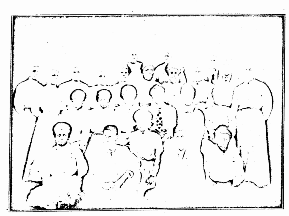
Pentecostal Young People-Zion City, Illinois.

His own power opened hearts to a rejoiced at this, another golden opdeep hunger for a closer walk with portunity to sow the precious seed Him. How sad it is for us to fail of truth "beside all waters." Just God, especially when we realize that here, how real it becomes to me each "Called to be partakers of His on our faithfulness most assuredly day, the manner in which many are divine likeness." My heart is thrill-there rests the salvation through perverting God's eternal truth. Let