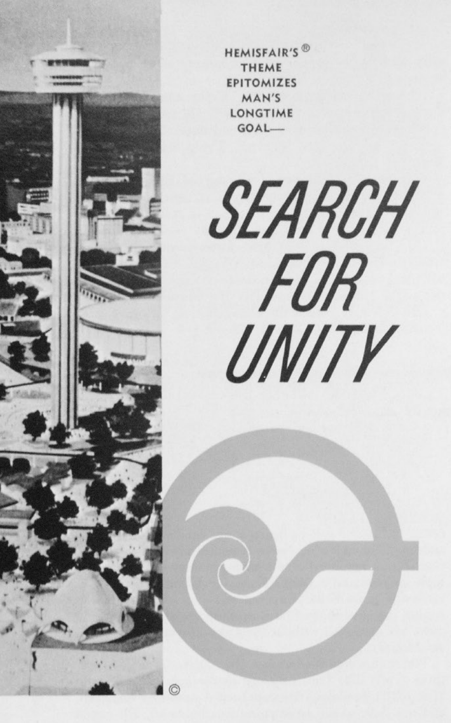
By JUDITH BACON

San Antonio's HemisFair® '68 celebrates the city's 250th anniversary by portraying the confluence of civilizations in the Americas.