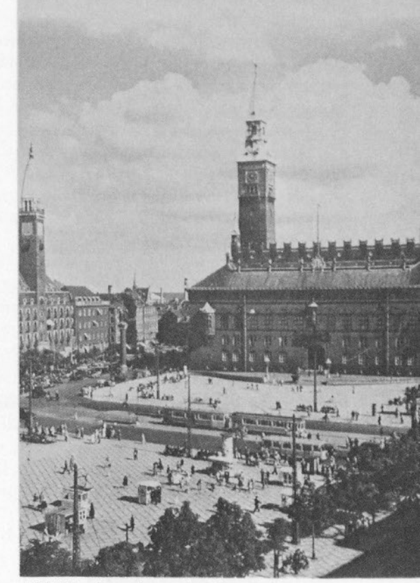
ABOVE: Copenhagen's City Hall was the center of all jubilee activities. BELOW: The Stock Exchange of Copenhagen with its spire of entwined dragon tails is the oldest active stock exchange building in the world.

We congratulate Copenhagen on her 800th birthday and wish her peace and prosperity in the years ahead.