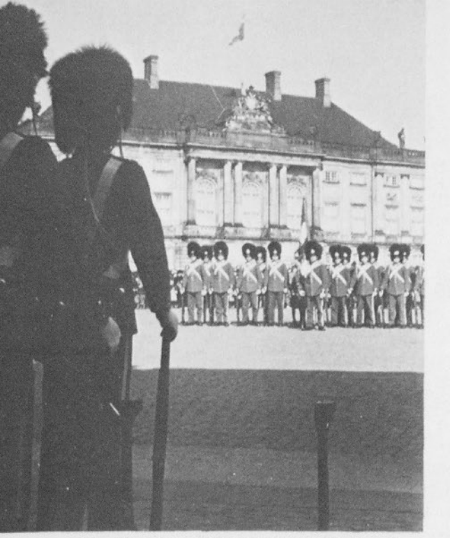
The changing of the guard outside Amalienborg Palace, the Royal Family's residence, is one of Denmark's tourist attractions.

OPENHAGEN, DENMARK—wonderful, friendly, and hospitable Copenhagen—has been caught up in exciting festivities for her 800th birthday.