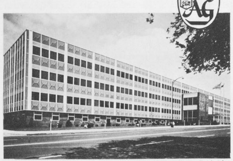
International Headquarters of the Assemblies of God, Springfield, Mo.

THE LATEST SURVEY SHOWS THAT THERE ARE 8,273 churches of the Assemblies of God in the U.S. It is one of the most rapidly growing religious denominations in the country, having registered a gain of over 40 per cent in number of churches and over 59 per cent in membership in the past ten years.