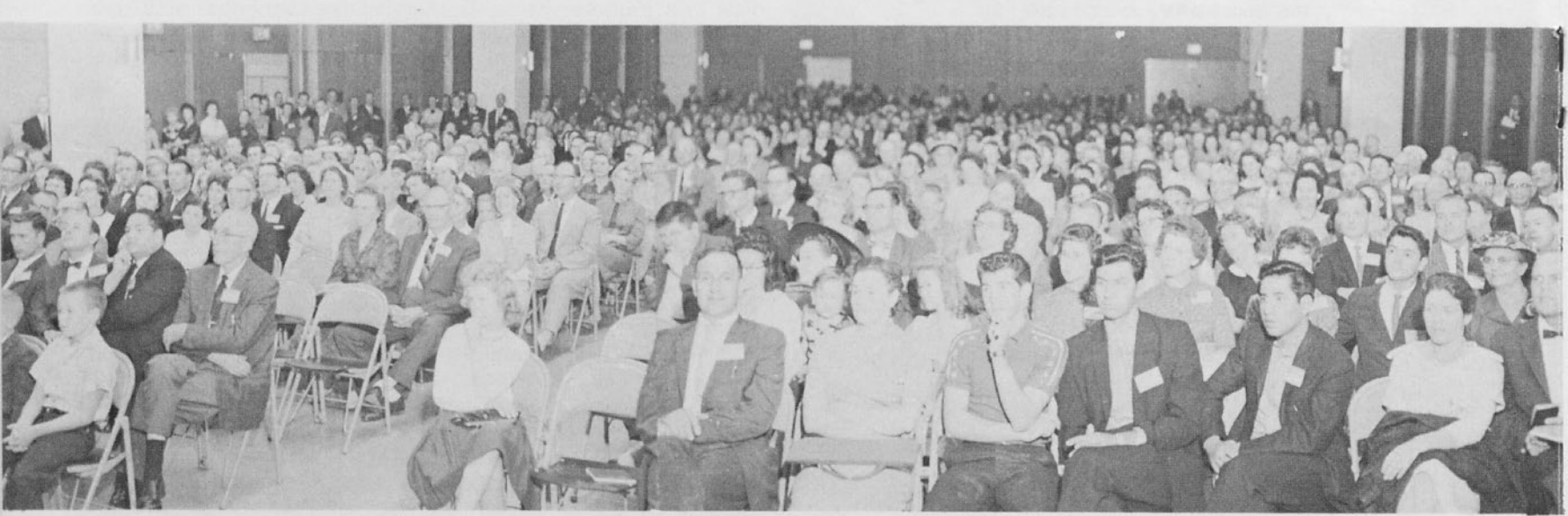
Portion of crowd that attended the daily afternoon sessions of the "Melody Music Hour" in the Coliseum annex during the General Council.