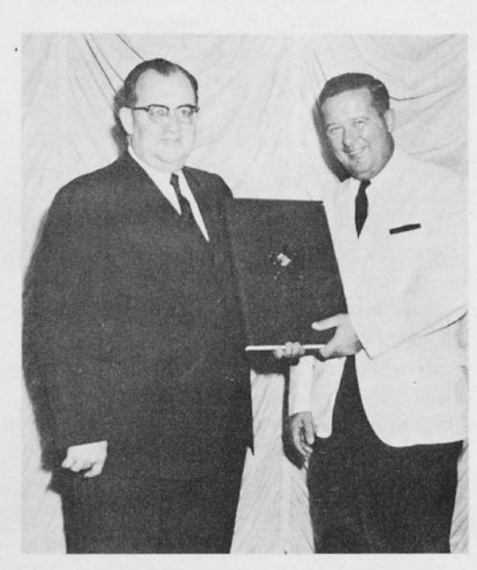
THE PENTECOSTAL EVANGEL

The 1962 convention of CBA will be at Chicago, Ill., July 22-26.