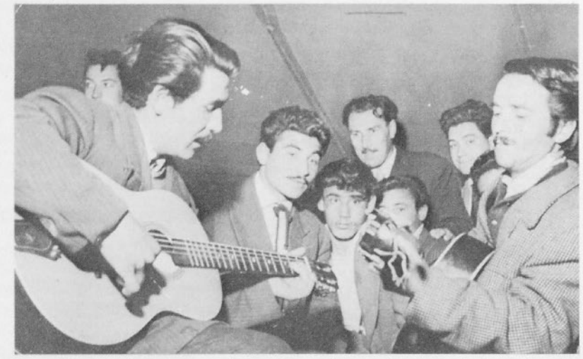
At night, in their tents, the gypsies sing praises to God and exalt His name.

fields of Normandy, was the scene of a revival in 1936 during which hundreds were saved. Churches were started in Lisieux and in the surrounding villages. However, because of strong opposition and the destruction during the war, the church was reduced to a handful of believers.