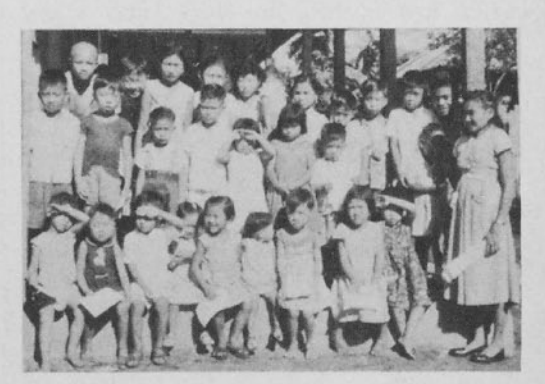
Sunday School at Labuha, Batjan, Indonesia

greatly hindered our Sunday School at first, but God is faithful in answering the persevering prayer of His people, and the Sunday School is being built up again. Chinese children are now allowed to come back to learn more of the Word of God.