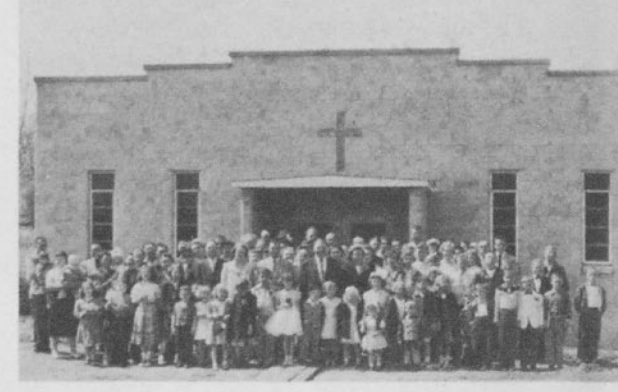
The Viroqua Assembly of God Sunday School

"Throughout the meeting, other denominational folk attended. As a direct result of the presentation of the gospel from the Pentecostal view they became hungry for more of God and became faithful attendants at the As-