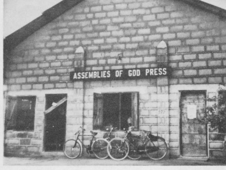
Here is the present inadequate building.

$5,000 Needed NOW to Enlarge Printing Plant