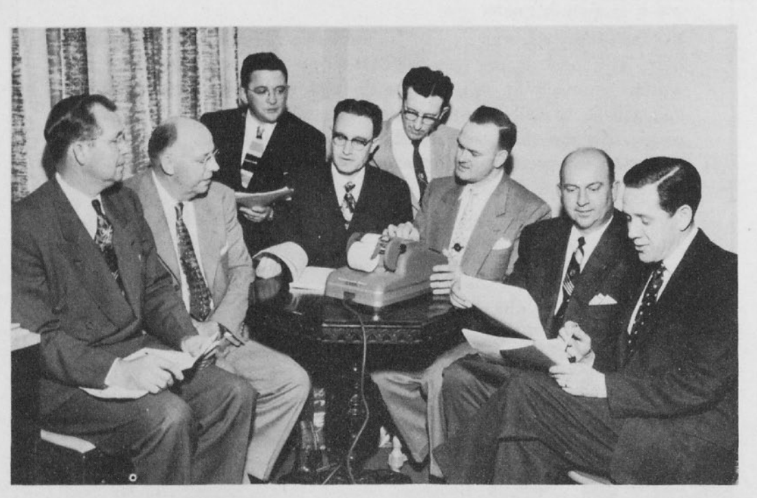
COMMITTEE TO REPORT TO GENERAL PRESBYTERS ON FINANCIAL APPEALS

You get the point. Some have bluepenciled the Lord's menu. They tell us that the "Best Dish" is not as full and satisfying as it once was. We should not expect a heartfelt experience of salvation with its accompanying joy and peace, they say. The Lord doesn't heal the body and confirm His Word with miracles, signs, and wonders, as He once did, they assure us. The baptism in the Holy Spirit, with its initial evidence and its accompanying power for service, was for another day, they affirm. That is what patrons are told in some churches, which are supposed to be "spiritual cafes" where hungry souls can be fed. But I thank God that Christ is "the same yesterday, and to day, and for ever" (Heb. 13:8), and that "all the promises of God in him are yea, and in him Amen, unto the glory of God" (2 Cor. 1:20). Hallelujah! The "Best Dish" is inexhaustible.