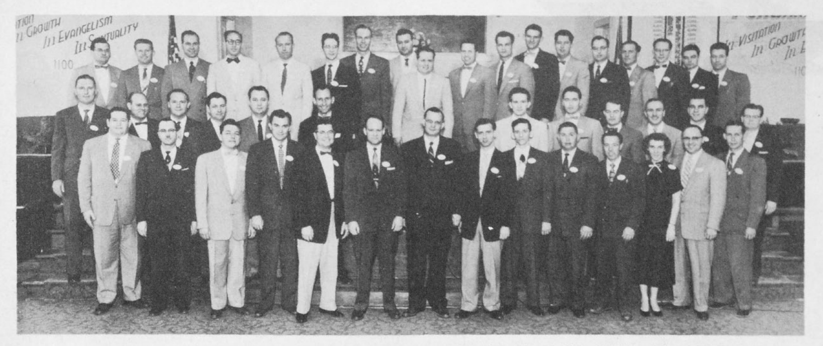
DISTRICT C. A. PRESIDENTS GATHERED IN SPRINGFIELD, MISSOURI, FOR TENTH ANNUAL CONFERENCE

Thirty-nine of the forty-three District C. A. Presidents attended the annual conference at Springfield, Mo., March 23 to 25. "Accent on Action" was the theme of the annual event, at which the leaders of the youth work of the Assemblies of God review the entire C. A. program and plan their work for the coming year.