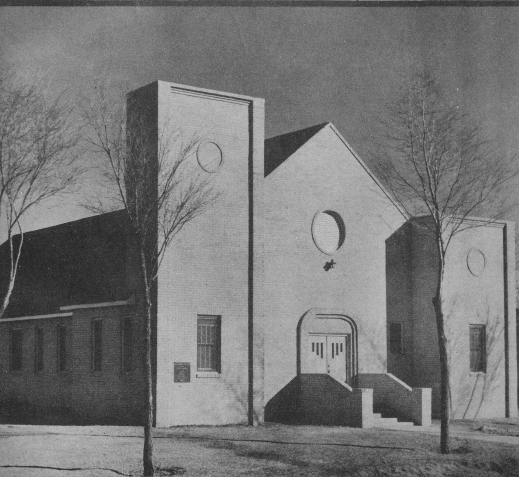
ASSEMBLY OF GOD Sayre, Oklahoma

NOT BY MIGHT, NOR BY POWER, BUT BY MY SPIRIT, SAITH THE LORD