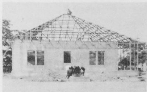
Finances needed to finish this house

Street, Springfield 1, Missouri, designated "Tanguieta Residence."