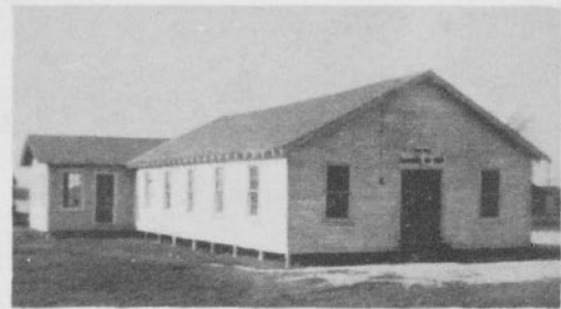
South Park Assembly, Waxahachie, Texas.

Kindly send your contribution marked "Hong Kong Church Building" in care of the Foreign Missions Department, 434 West Pacific Street, Springfield 1, Missouri.