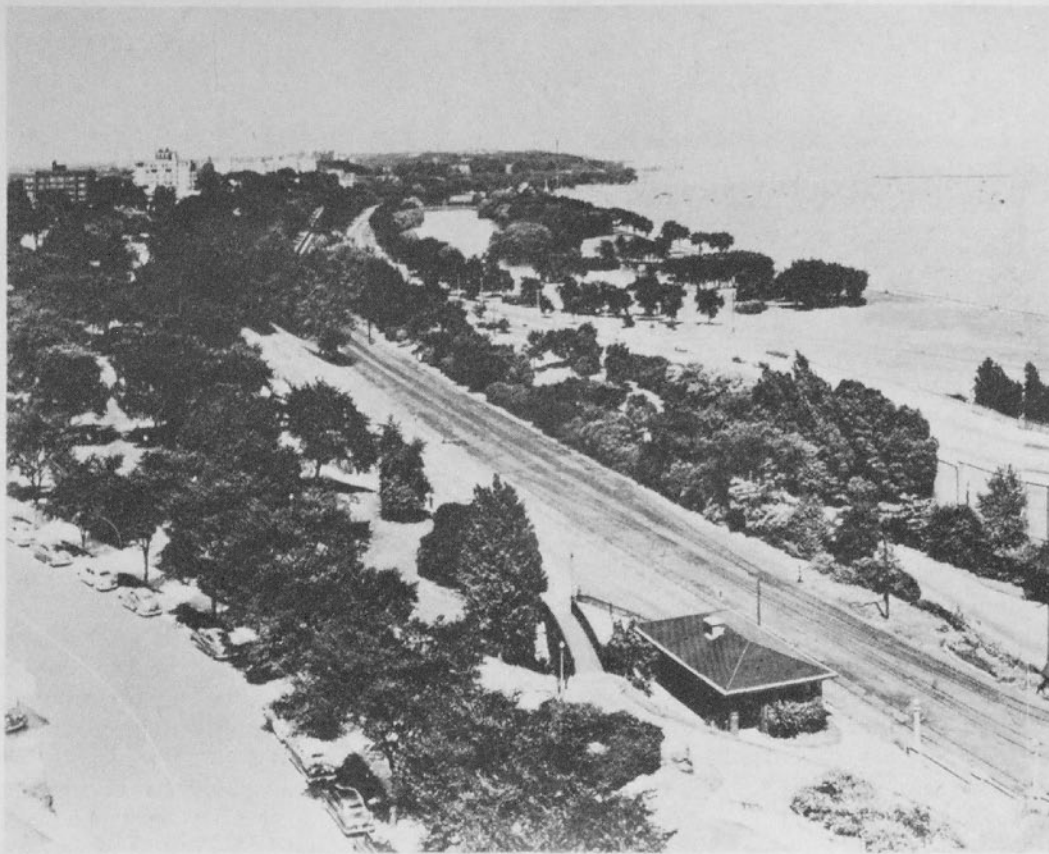
The lake front at Milwaukee, Wisconsin. This is the city where the General Council of the Assemblies of God will meet August 26 to September 1, 1953.

Park. The one is a waste, the other a panorama of beauty, owing to its picturesque mountains, enchanting dells, lakes, and waterfalls.