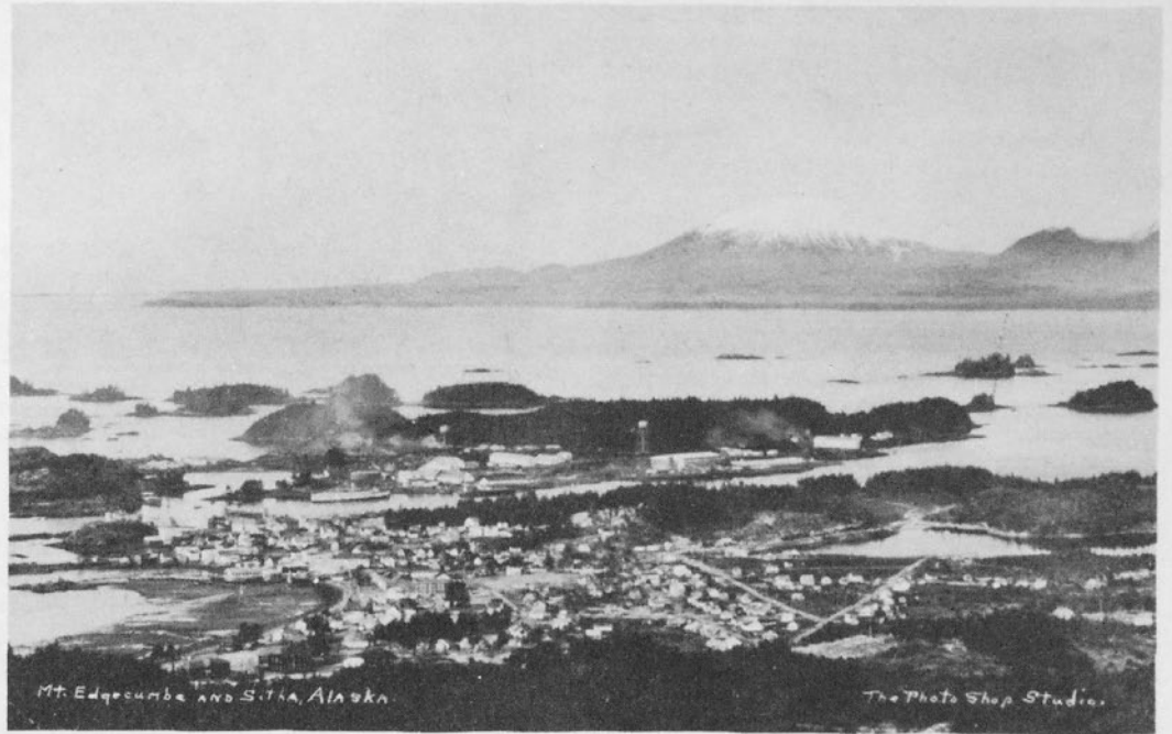
Sitka, Alaska, where God is moving in a special way. Sitka is the world's leading port for king salmon, and harbors more than a thousand small fishing boats. Beautiful Mount Edgcumbe is in the background.

The First Martyr for Christ (lesson for Sunday, May 17). Lesson text: Acts 6:8, 10-12; 7:54-60.