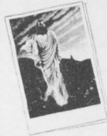
"He Arose" 8 FO 5495 An early morning sunrise scene in blues and pinks. Christ triumphantly comes forth from the tomb. Ideal for Easter program.