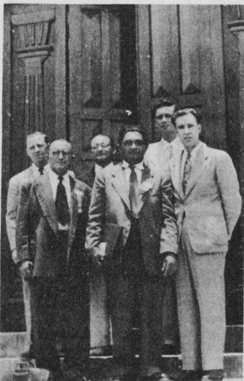
LEFT: Newly elected officers and presbyters of the Venezuelan field. The building in the background is the Templo Evangelico in Caracas. The picture was taken in August during the Seventh Annual Convention of the Assemblies of God of Venezuela.

At one place in El Salvador where God has been blessing in a special way in evangelistic services, the Christians have been persecuted severely. Stones have hammered the building and broken the tiles. The doors have been marred by machete blows. Several determined attempts have been made to destroy the church. Once the enemies of the gospel surrounded the place. The lights were