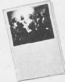
"The Lord's Supper" 8 FO 5493 Sallman depicts the disciples as younger men singing a hymn which was the last thing that occurred before they left the upper room for the garden of Gethsemane.