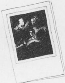
"Christ Our Pilot" 8 FO 5491 Here a youth is shown at the helm in a storm-swept craft. Christ has appeared to pilot the boy through to safety. The boy now is confident. Suggested for youth services etc.