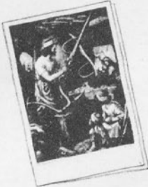
"The Carpenter of Nazareth" 8 FO 5490 Jesus is shown as a strong young man actually doing the heavy work in the carpenter shop. The children listen to His words. His mother ponders them in her heart.