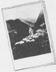
"He Leadeth Me" 8 FO 5492 A beautiful and awe-inspiring design of the Shepherd leading His flock! Gorgeous color harmony with mountains, rocks and trees.