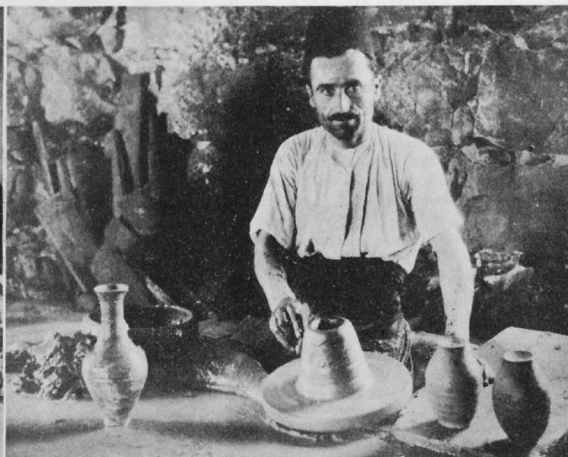
POTTER IN LEBANON WORKING AT HIS WHEEL

Many Syrian women still bake the family bread in this traditional manner. The worker at right, using flour and water and a bit of leaven mixed into a thick dough, rolls out a thin wafer about a foot wide, which the woman at left bakes quickly on a circular sheet of metal set over a charcoal fire. In the center looms a stack of the wafers, ready for the family's "bread box."