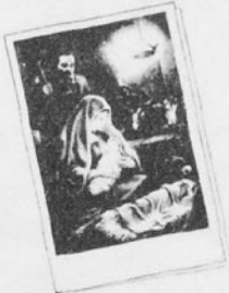
"The Nativity" 8 FO 5494 A beautiful portrayal of the manger scene. Done in rich warm colors. Ideal for Christmas program. 8 FO 5497 Not illustrated. A new design for Christmas. Features the Mother and Child Jesus.