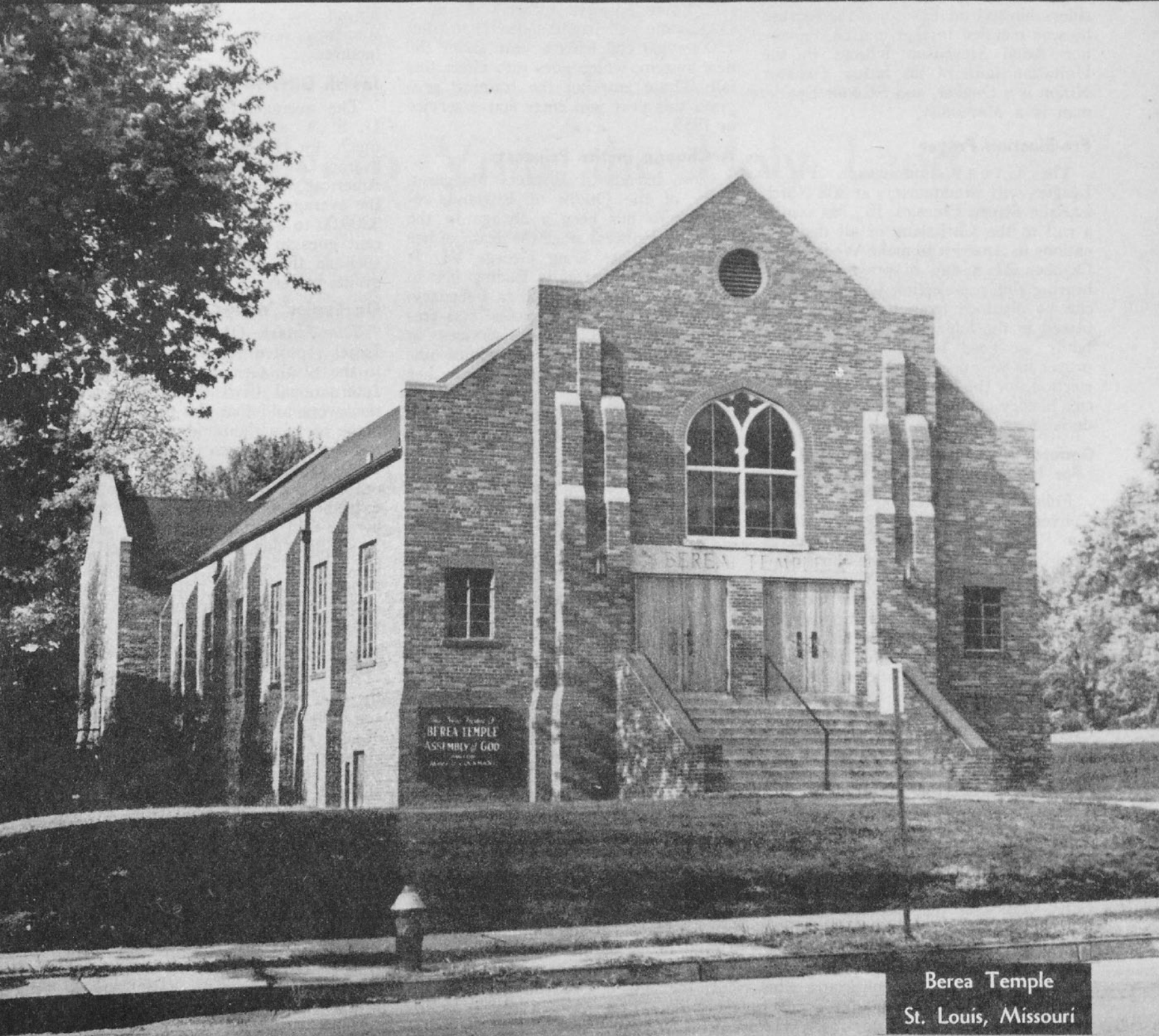
Berea Temple St. Louis, Missouri

NOT BY MIGHT, NOR BY POWER, BUT BY MY SPIRIT, SAITH THE LORD