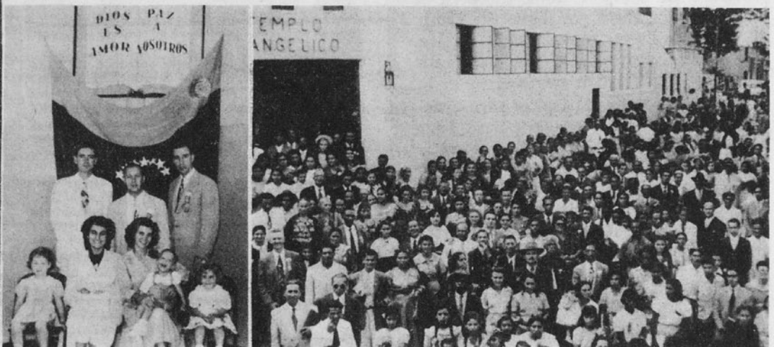
RIGHT: Some of the Christians and friends in attendance at the meetings in Caracas. Fifty persons were saved during the meetings. A gracious revival spirit exists throughout the Venezuelan field.