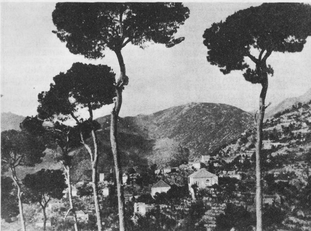
THE PINES OF LEBANON

Where once the famous cedars of Lebanon flourished, these umbrella pines frame vistas of peasant homes set in their terraced gardens of mulberry trees and grape vines.