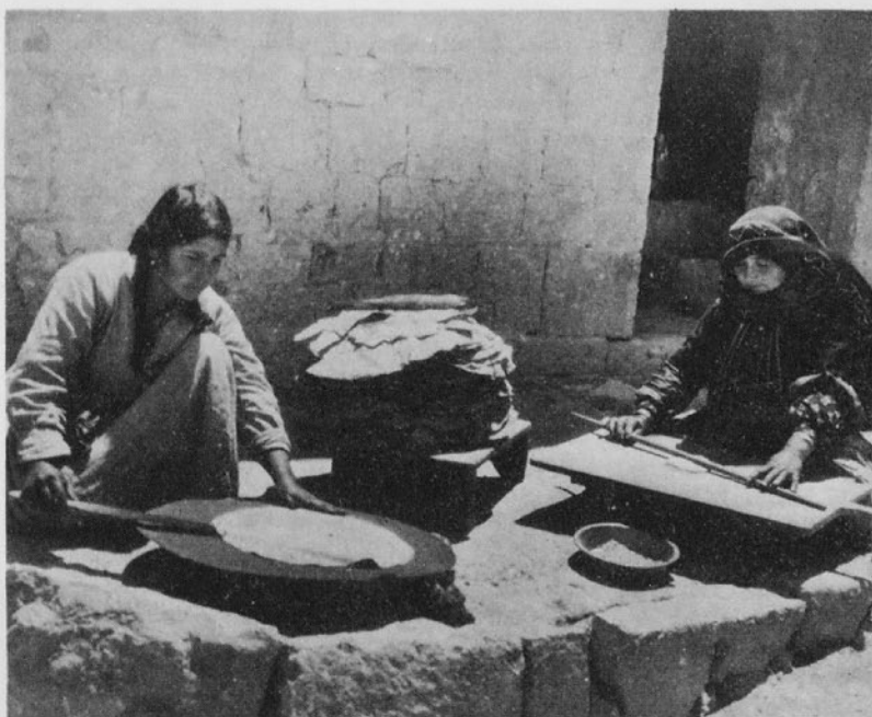
HOUSEWIVES IN SYRIA BAKING BREAD

The student of Scripture will recall that it was near Damascus where a light from heaven shined round about Saul of Tarsus as he was on his way to the city with the express purpose of persecuting any Chris-