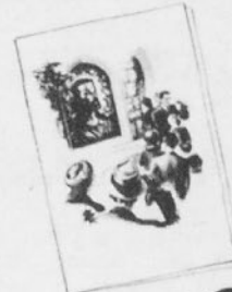
"Let's Go To Church" 8 FO 5496 A new design with church window featuring a different handling of Sallman's "Head of Christ" painting. Right for Rally Day or other activity services.