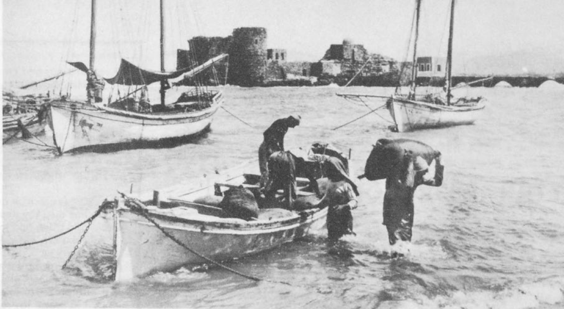
Grain from Cyprus arrives in Sidon's ancient man-made harbor