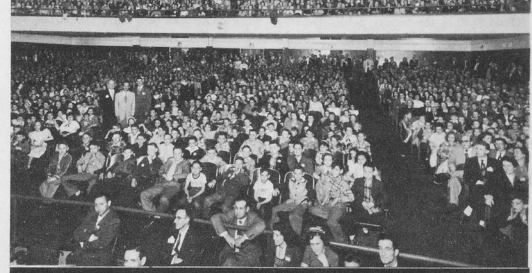
... and the children were packed in at High School