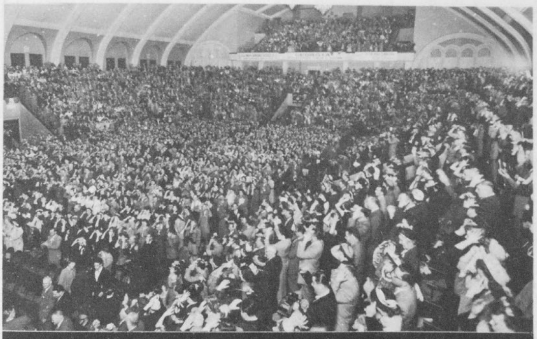
The Shrine Mosque was packed every night . . .