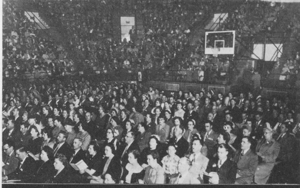
... while another crowd was meeting at S.M.S...,