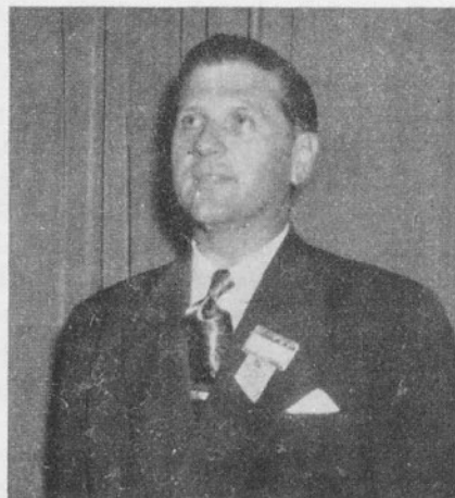
Evangelist Arne Vick

dictory. We go along more or less care-free and indifferent to the terrible state of our unsaved loved ones, until suddenly death takes one of them. The moment one of our unsaved loved ones dies we are gripped with a frenzy of anguish and with a distress that is pitiful to see. We stand beside the open grave of a loved one concerning whose salvation we are uncertain, and wring our hands. It is easy then to shed copious tears, but it is too late. God is trying to give us that anguish while there is yet time. God wants to give His people a ministry of tears.