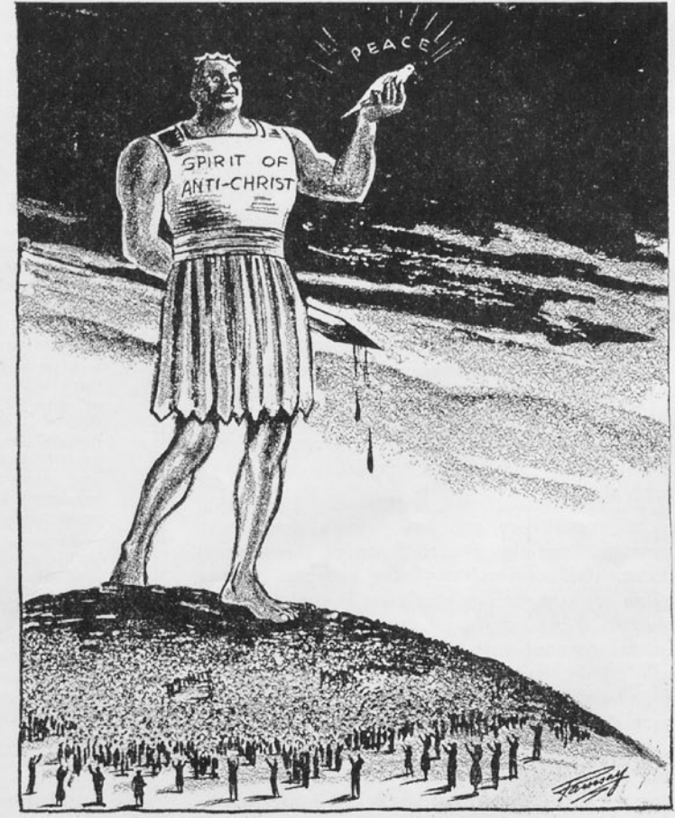
"BEHOLD THE KING WHOM YE HAVE CHOSEN!"

The Child Samuel (Lesson for April 16). Lesson Text: 1 Samuel 3:1-10.