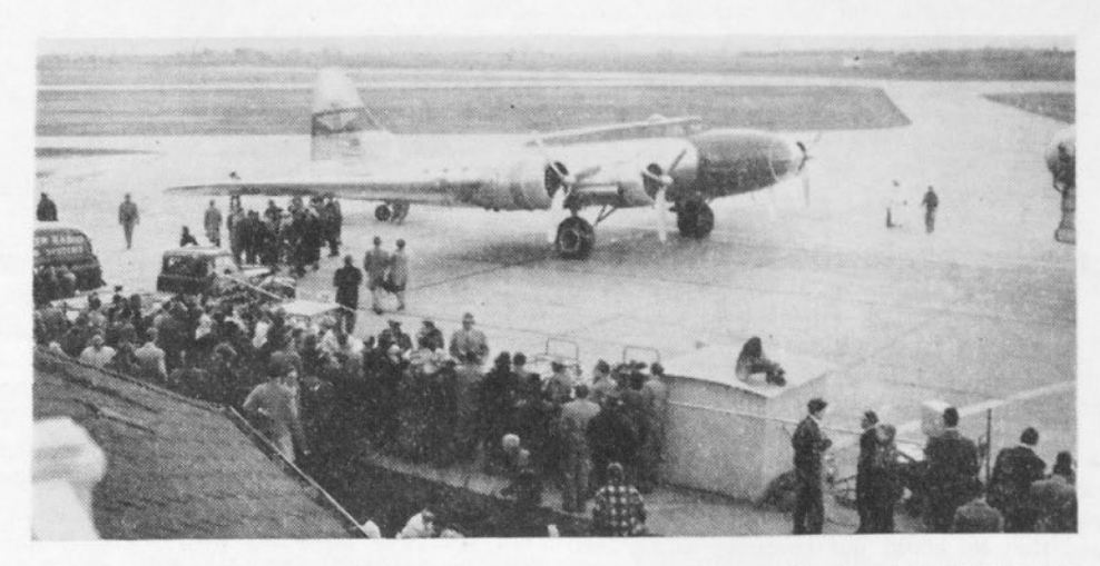
If you would like the thrill of joining a group such as this boarding the AMBASSADOR for West Africa, enter the 1950 Subscription Increase Effort and secure more subscriptions than anyone else for The Missionary CHALLENGE .

There is a chapel in the mission building, and services are being held regularly though it has not been opened officially. We are confident that, after the chapel has been opened and a sign erected, many will be attracted.