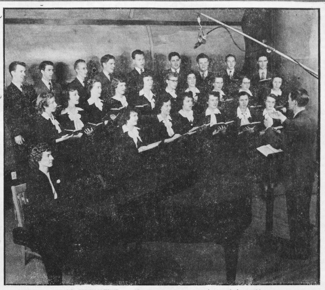
It's REVIVALTIME—on the air coast to coast and around the world See page six

NOT BY MIGHT, NOR BY POWER, BUT BY MY SPIRIT, SAITH THE LORD