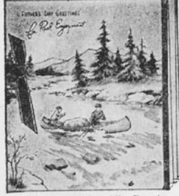
No. H6500 15 Cents Size 5x6 inches