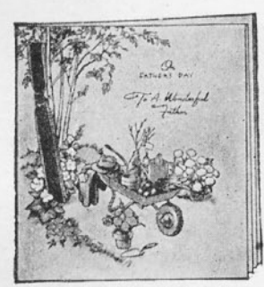
No. H6700 25 Cents Size 51/4x61/4 inches

Father always appreciates the thoughtfulness and love that lie back of the remembrance he receives on "his" day, especially so if we use a MAN'S card such as these new, original designs from the "Sunshine Line."