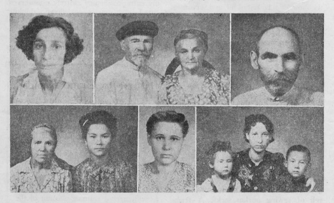
The difficulties of their flight from Communist persecution have left their indelible stamp upon the faces of these ten. They are a part of the seventy who have thus far reached Shanghai in an endeavor to seek refuge in the United States.

We would suggest that any offerings sent in to help these people be designated "for Russian refugees" and should be sent to the Foreign Missions Department, 336 W. Pacific Street, Springfield, Missouri.