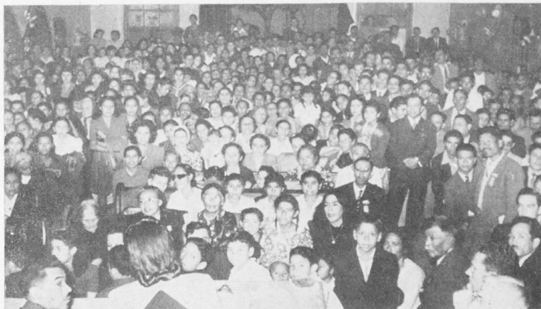
● A view of the group gathered for the convention in Monterrey, Mexico.

In San Luis Potosi, an interior Mexican city, I preached for two nights to a congregation of fifty-five. In this most fanatical city, the Catholics have a "captain"—a watchman—in every block. If strangers approach any house, it is the "captain's" duty to inquire into their business and, if they are Protestant workers, to report to the priest when their literature has been accepted. Christian work in central Mexico is very difficult. Even this year there have been martyrs who have given their lives in propagating the gospel. Knowing this, I was surprised at the number of Christians in our