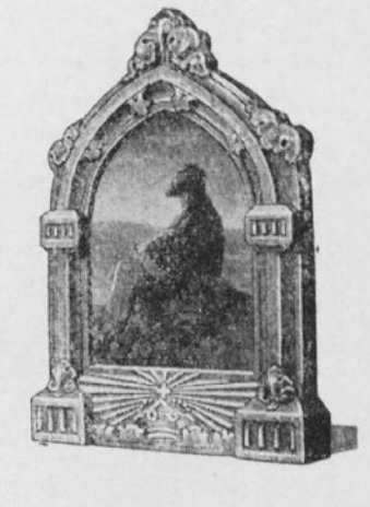
Order by number

No. 1955-Head of Christ No. 1956-Gethsemane No. 1957—Christ at Heart's Door