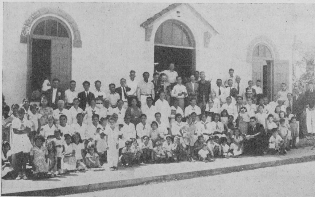
● Church and congregation at Humacao, Puerto Rico.