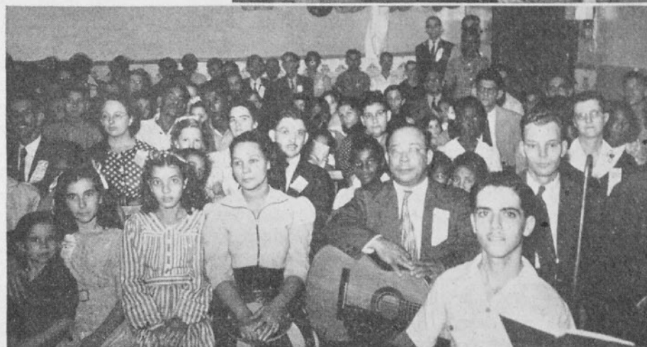
● A portion of those attending the Cuban Conference.

an unbeliever who had forbidden his wife to even have a Bible. When she told him of some healings he was very incredulous and said he would have to see in order to believe. She told him he should be careful for the Lord might afflict one of them or their unborn child. He defiantly replied, "Well, let it come."