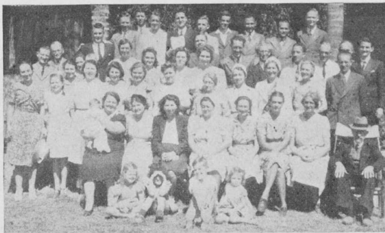
● Forty Assemblies of God missionaries and a few friends get together for the 1945 Biennial General Conference in South Africa.

Brain service can be bought. Lip service can be hired. Physical service can be contracted for. But what God asks is heart service.— Selected.