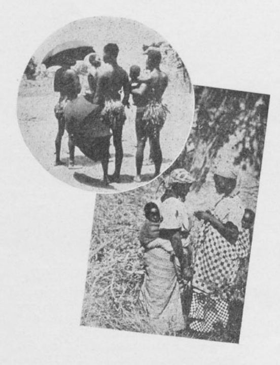
• Contrast the heathen Gourounsi women in the circle with the Christian women below.

The medicine men became furious. The Catholic teacher sent to his Superior for European medicine so he could hold his own people and run a "competitive business." But no native "tim" nor white man's eye medicine can bring sight to blind eyes. It takes believing prayer and a prayer-answering God. But God did open—and is still opening—the physically and spritually blinded eyes of these people who saw their first missionary, heard their first Gospel song, and saw their first Bible—less than ten years ago!