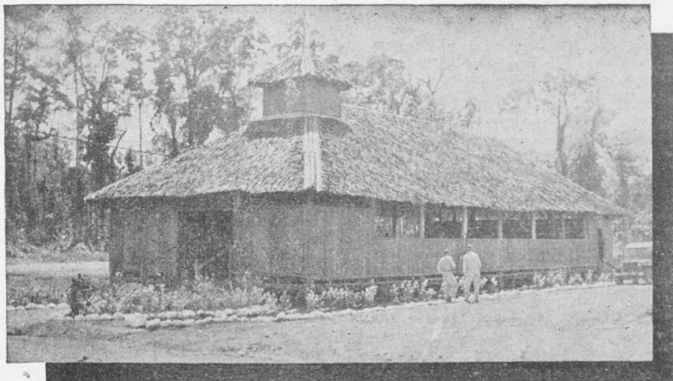
A chapel in New Guinea which is becoming a G. I. revival center