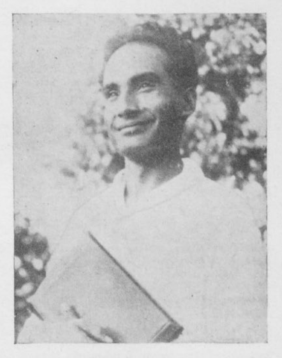
Bakht Singh of India

The change came on a holiday trip to Canada in 1928. He was attracted to a religious service in the first-class dining saloon of the boat, and more out of a curiosity to see the dining room than from a desire to hear the gospel, he attended