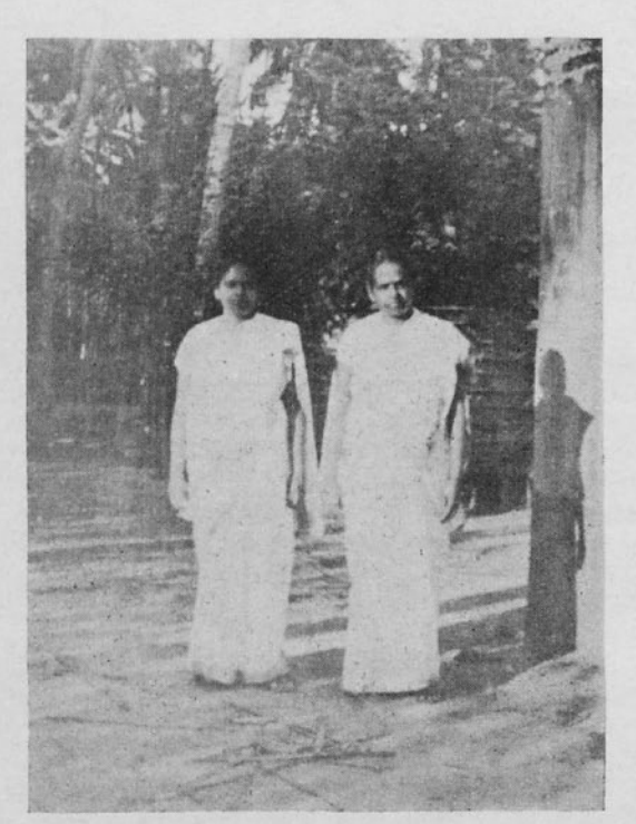
Two consecrated believers in Ceylon

Street meetings have ever been one of the best means of getting the gospel out to the unsaved, and this holds true in India as well as in America. We were happy for the good report of the blessing of God upon