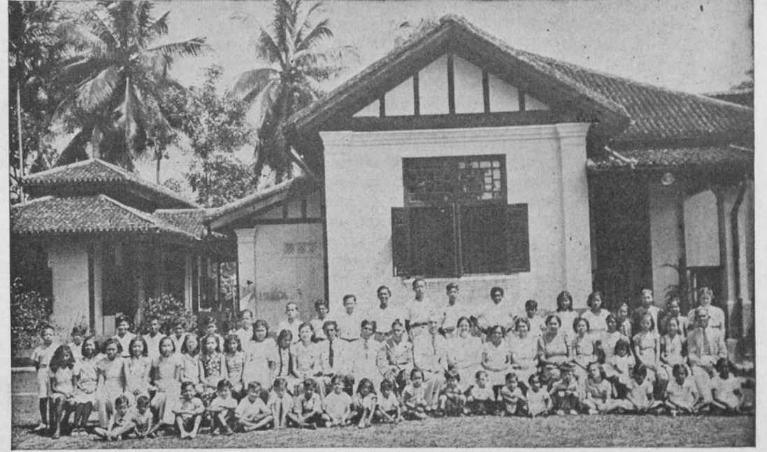
The Assembly of God at Singapore, taken at the time of the Daily Vacation Bible School. key, wine, and other The work continues in Malaya under native workers. (See Page Ten)

The people suffered during those days, not only by the Japanese but also by the natives themselves, who looted the stores which had been bombed, and were now unguarded, and drank to their fill of the whiskey, wine, and other (See Page Ten)