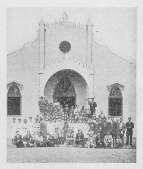
Part of the crowd attending dedication of new temple at Arecibo, Puerto Rico.